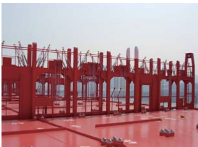
■ LASHING BRIDGE SYSTEM

Practical experience in steel block fabrication and cargo handling systems assures us that we are getting the most comprehensive and advanced production system available. With our 2nd factory in Mokpo, we offer customer our systems from design to installation as a turnkey solution.