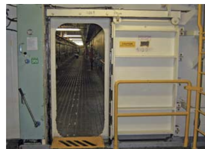
■ HYDRO. DOOR SYSTEM