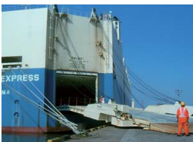
■ EXTERNAL RAMP SYSTEM