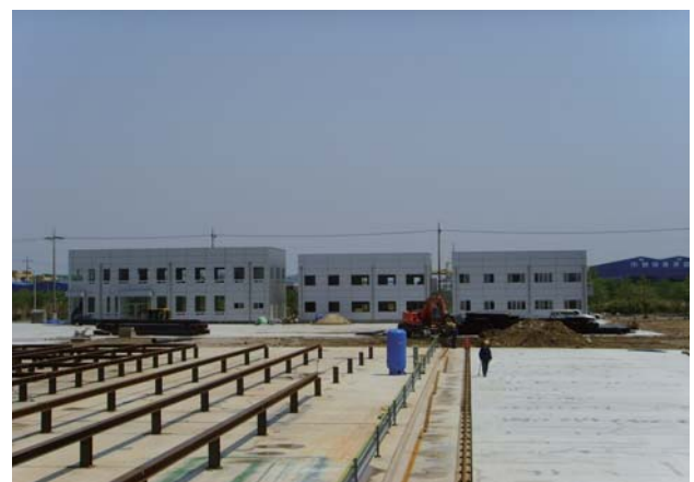
■ WORKMAN HOUSE