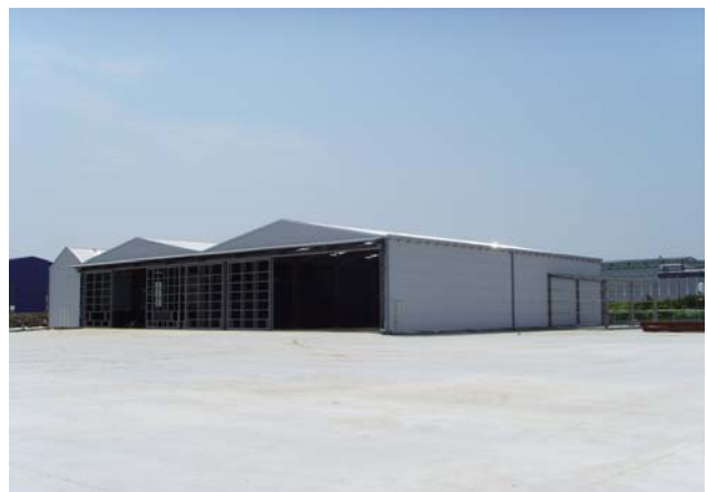
■ PAINT SHOP