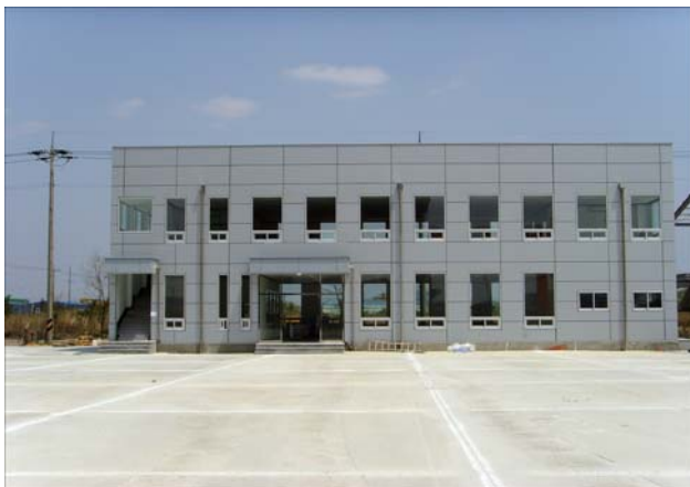
■ OFFICE BUILDING