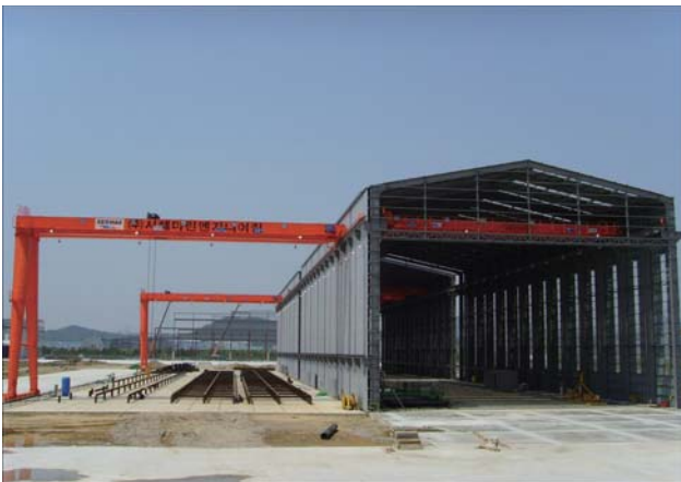
■ MAIN WORK SHOP

Our new factory in Mokpo not only gives us a solid and highly competitive local presence, but also means we can service our customers with the advanced system.