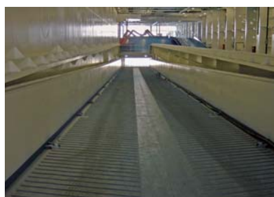
■ INTERNAL RAMP SYSTEM