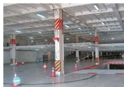
■ CAR DECK SYSTEM